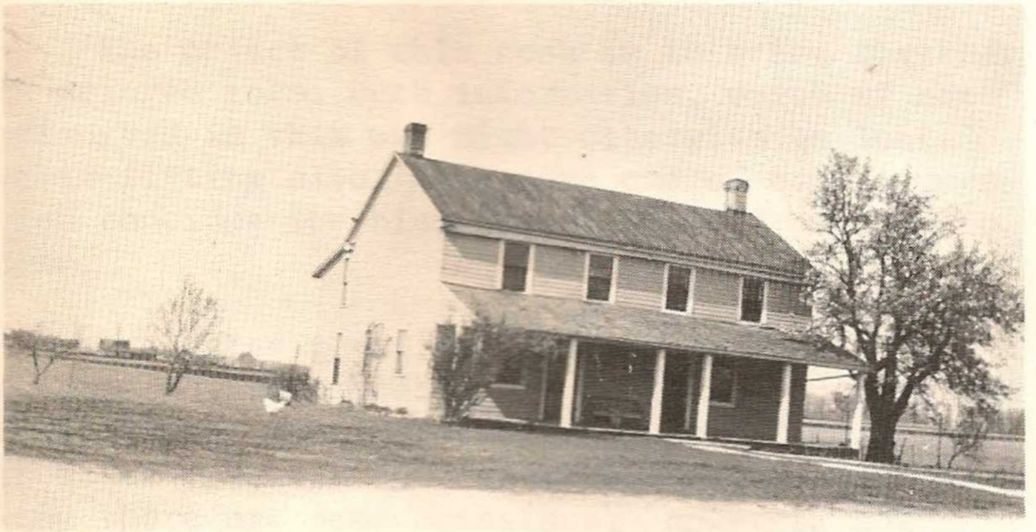
Long Home taken in 1937